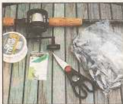
All the needed gear - line, hooks, scissors for bait, a good supply of sinkers.