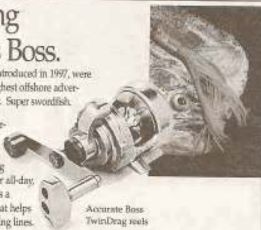
Accurate Boss TwinDrag reels

Now we're introducing our new lighter-duty, dual-drag models. Boss TwinDrag™ inshore reels, because even smaller game fish can put up a big fight. New Boss TwinDrag™ reels offer all-day, arm-friendly, silky-smooth casting, plus a patented, revolutionary drag system that helps prevent breakoffs of lighter, less-forgiving lines.