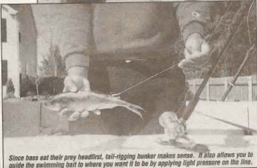
Since bass eat their prey headfirst, tail-rigging bunker makes sense. It also allows you to guide the swimming bait to where you want it to be by applying light pressure on the line.