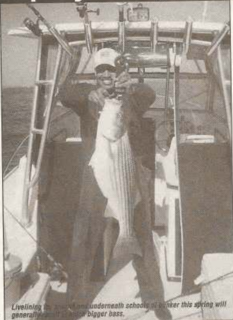
Liveling by hand and underneath schools of bunker this spring will generally result in much bigger bass.

It's important to remember that many of the bigger bass you'll hook up with this spring while liveling, particularly along the Delaware and up into the Raritan, are spawning females. A big roe-filled cow of 30 pounds or more can be carrying thousands of future lineiders, so a quick release is a good idea.